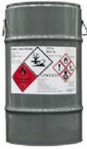
(a) 54 litres